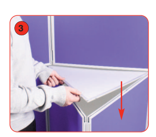
Lower the table top onto the bottom set of panels making sure it is securely in place